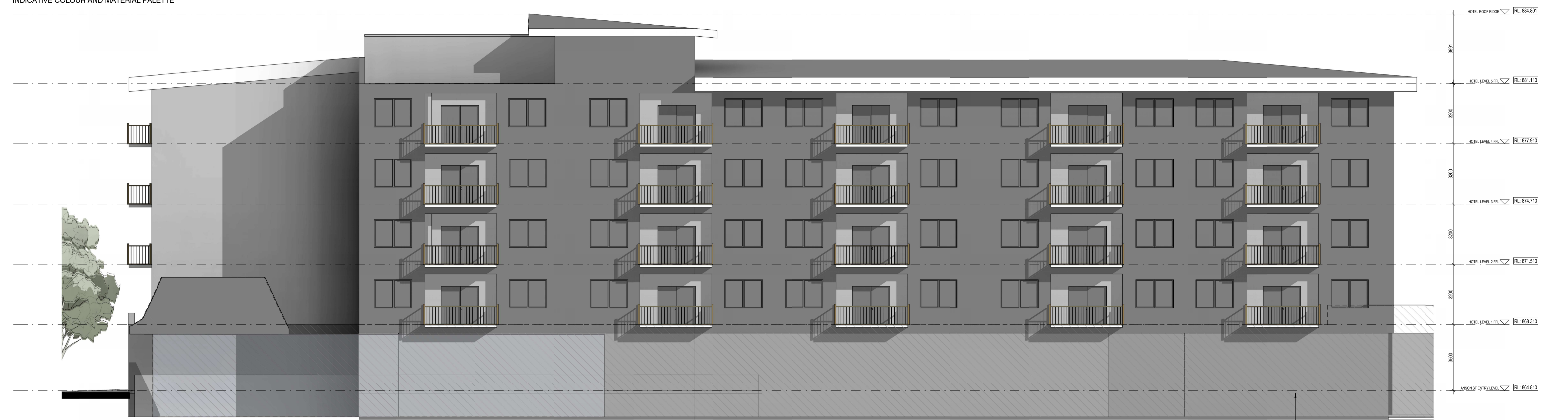
SOUTH ELEVATION - PROPOSED APARTMENT DEVELOPMENT 1:100